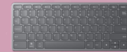
Lenovo Multi-Device Wireless Keyboard ZG38C05813