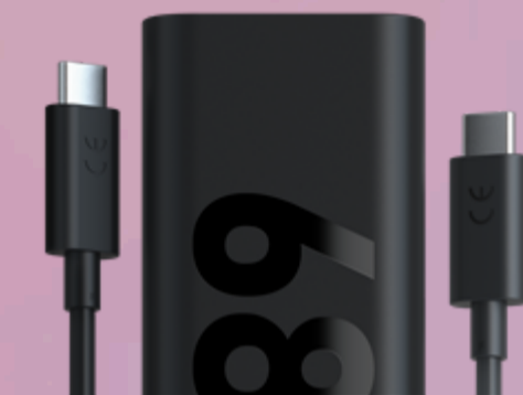
Lenovo 68W USB-C Wall Charger ZG38C05739