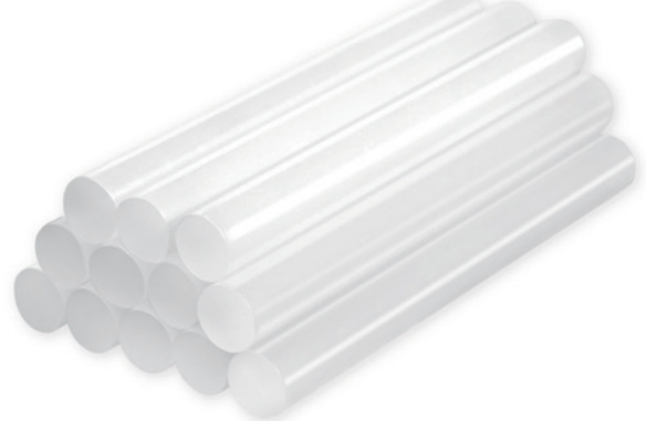
Fits 11.2mm hot glue sticks (WZ0054)

Simply pop in a glue stick, warm it up for 3-5 minutes, then gently pull the trigger and start gluing.