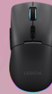
Lenovo Legion M220 Wireless RGB Gaming Mouse GY51U28359