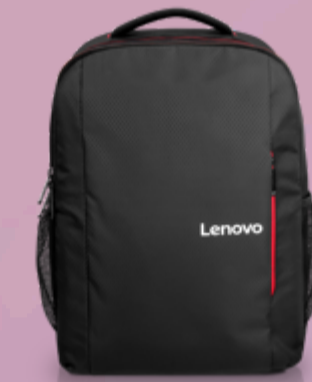
Lenovo 16" Laptop Everyday Backpack B510 4X41U80414

Please click here to view the full list of accessories.