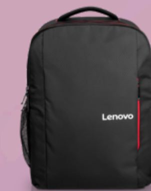
Lenovo 16" Laptop Everyday Backpack B510 4X41U80414