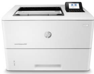
HP LaserJet Enterprise M507dn

Choose an HP LaserJet Enterprise printer designed to handle business solutions securely and efficiently, and helps conserve energy with HP JetIntelligence toner. Keep up with the demands of growing business with a printer you can rely on.