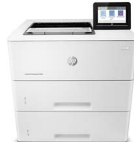
HP LaserJet Enterprise M507x

Dynamic security enabled printer. Only intended to be used with cartridges using an HP original chip. Cartridges using a non-HP chip may not work, and those that work today may not work in the future. Learn more at: http://www.hp.com/go/learnaboutsupplies