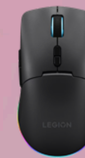
Lenovo Legion M220 Wireless RGB Gaming Mouse GY51U28359